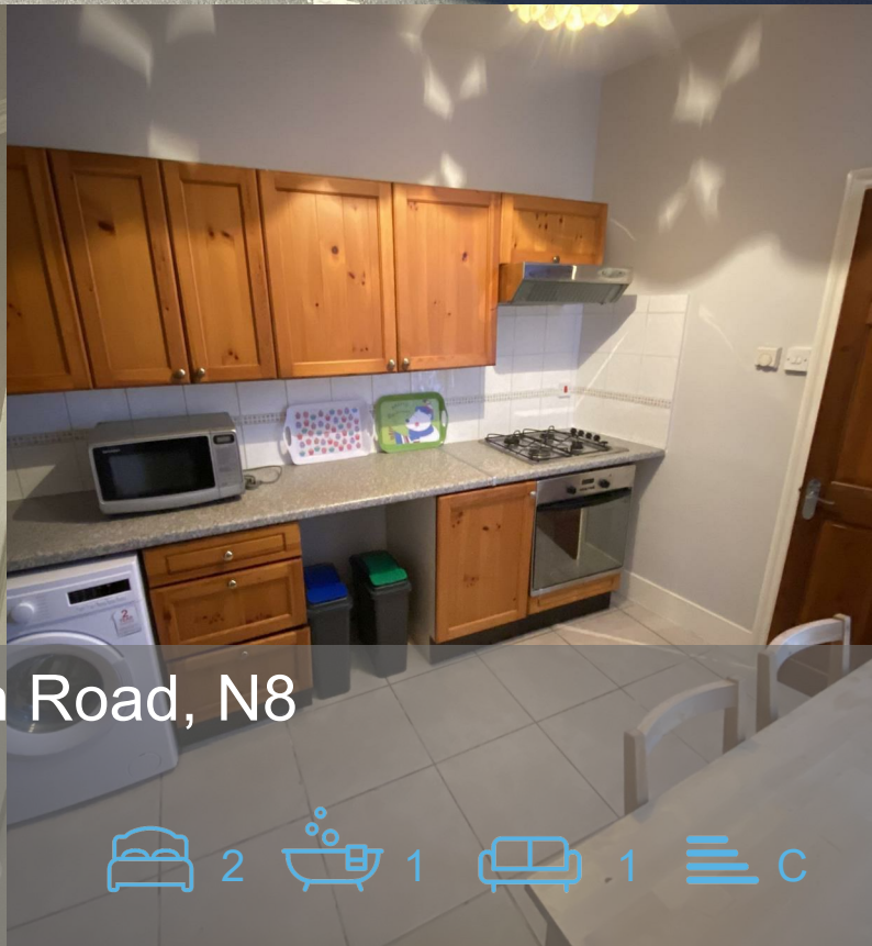
Station Mansions, Wightman Road, N8